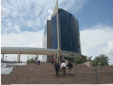
CPX Location, Adama, Ethiopia

For the past ten years, EASF has focused on building capacity to respond to security needs using an integrated approach that brings the three components (military, civilian and police) together