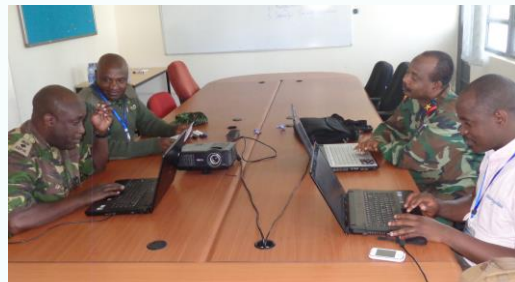
EASF PLANELM Staff during the CPX Final Planning Conference

CPX 2014 was designed to be executed in four phases: Preparatory Phase, Confirmation Phase, Execution Phase and Recovery Phase . The preparation phase included three Planning Conferences: The Initial Planning Conference (IPC), the Main Planning Conference (IPC) and the Final Planning Conference (FPC) where EASF staff and Member States held detailed discussions on the organization and execution of the Exercise. The core planning team also visited the Exercise location in Adama, Ethiopia, to conduct a CPX recce