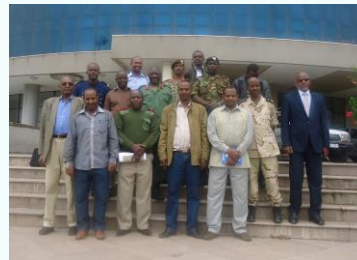
EASF Staff during an initial visit to the CPX location

As part of preparations for operational capability EASF has also organised major Exercises in different Member States to provide an opportunity for interaction, to demonstrate the inherent potential compatibility of the Forces to work together as well as help to assess their readiness for deployment. This includes a Command Post Exercise (CPX) 2008 which was held in Nairobi, Kenya, followed by a Field Training Exercise (FTX) 2009 in Djibouti;