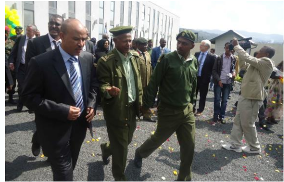
Hon Hon Siraj Fegessa, Minister for Defence of the Federal Democratic Republic of Ethiopia, with other guests during the official opening of the Logistics Base

environment in CARANA and called for all conflicting parties to desist from activities that might aggravate the already fluid situation. The PSC further authorized the deployment of an Africa Union Mission in CARANA (AMIC I) with the broad mandate of restoring stability in CARANA and tasked the Eastern Africa Standby Force (EASF) with the implementation of the 7,000 strong AMIC mandate for the initial 6 months duration.