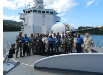
EASF Member States in a Maritime Course

EASF's approach is to hold trained staff on standby in their respective countries ready for deployment in peace-keeping