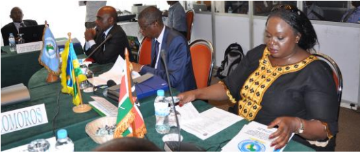
Amb Issimail Chanfi (3 rd right) with Ministers of Defence and Security of the Eastern Africa region at a past Meeting

Encouraged by the successes from these Exercises, the Council of Ministers of Defence and Security