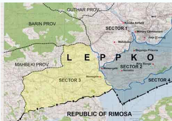
Map of Leppko Province, (Sector boundary)

The Eastern Africa Region Member States as well as the International Community having noted the events unfolding in the Republic of CARANA did not want the violent events in LEPPKO Province to spill over beyond CARANA and destabilize the entire region. Therefore, an Extraordinary Session