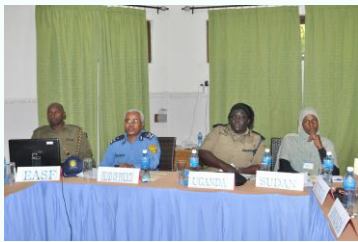
EASF Police Component in a workshop

In a PSO, the police unit is responsible to support the local police and the population, and to restore law and order. Capacity-building programmes for the Police component are two-fold: Individual Police Officers (IPOs) and Formed Police Units (FPUs). EASF has trained FPU in areas such as public order management, General Service Unit (GSU), VIP protection, protection of property,